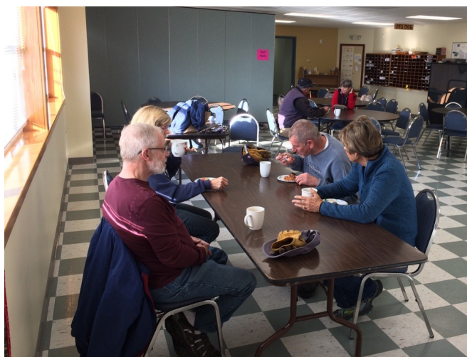
Food for the workers on Fall Clean up day Nov 5th