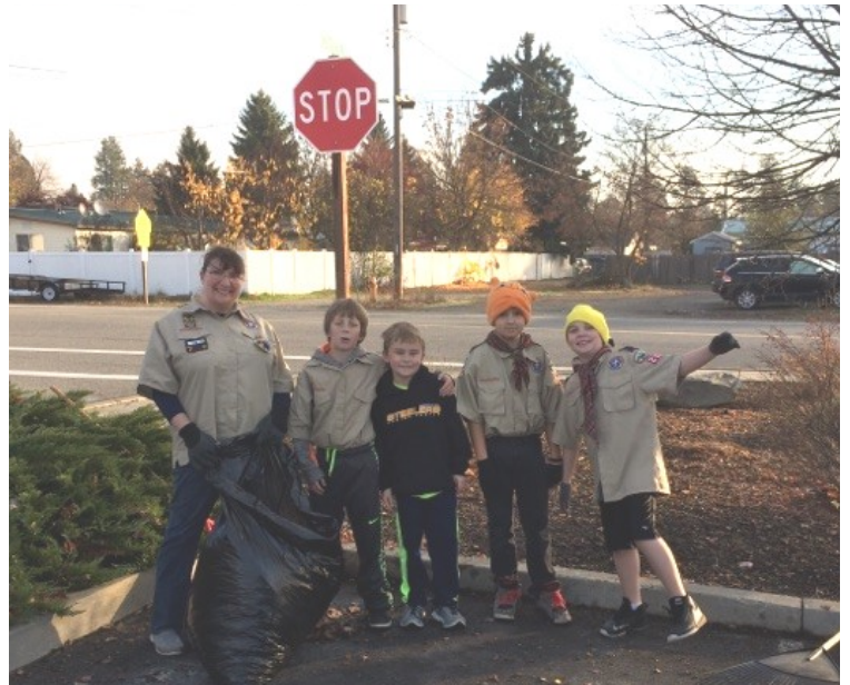
Work party beautifying the church, November 5th! Thanks

9:00 a.m. Worship Service w/ Children's Church 10:00 a.m. Fellowship 10:30 a.m Adult Education 10:30 a.m.. Connect Tweens Time